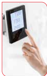
It takes just the press of a key on the multi-function touch display to send the measurements to a seca 360° wireless printer or PC. No need to worry about fingerprints – the touch display is very easy to clean.