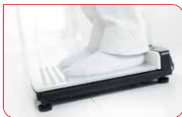
The stable glass platform with integrated heel positioner guarantees precise measurement results and a secure foothold, even on a free-standing scale in the middle of the room.