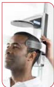
The measured height is shown in the display on the headpiece.

With the seca 360° wireless technology the seca 285 can wirelessly transmit results to the optional seca 360° wireless printer. With network-capable software seca analytics 115 and the wireless adapter seca 456, measurements can be received by your PC, analyzed and made available to an existing Electronic Medical Record (EMR) system. So the seca 285 is EMR-integrated and ready for electronic medical records and all the requirements the future brings with it. More about EMR integration is at www.seca.com .